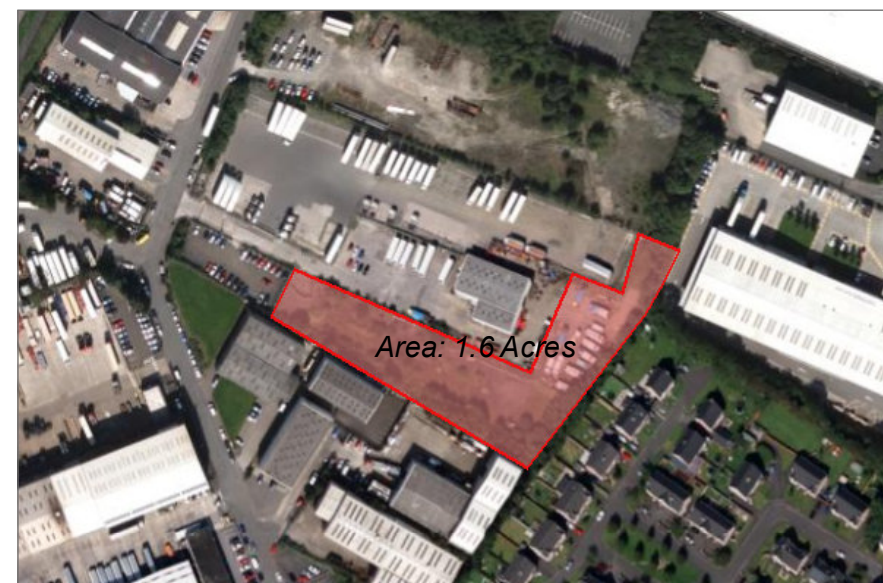
For illustration purposes only.