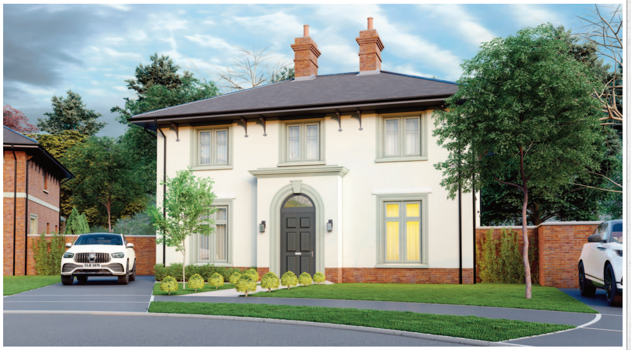
ABOVE: COMPUTER VISUAL SHOWING SITE 2A