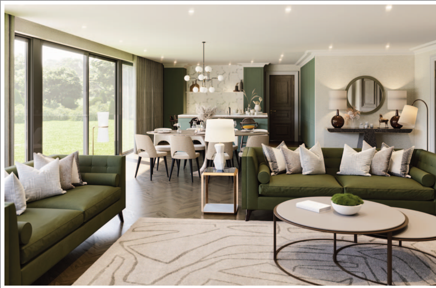
ABOVE: COMPUTER VISUAL FROM THE MULLBERRY SHOWING LIVING / DINING / KITCHEN AREA OPPOSITE: COMPUTER VISUAL FROM THE GATELODGE SHOWING LOUNGE