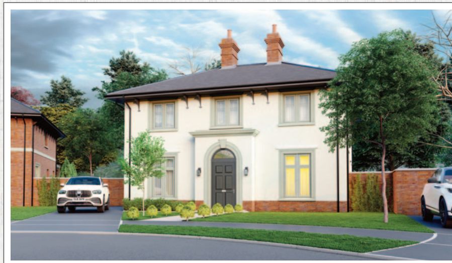
ABOVE: COMPUTER VISUAL OF SITE 2A