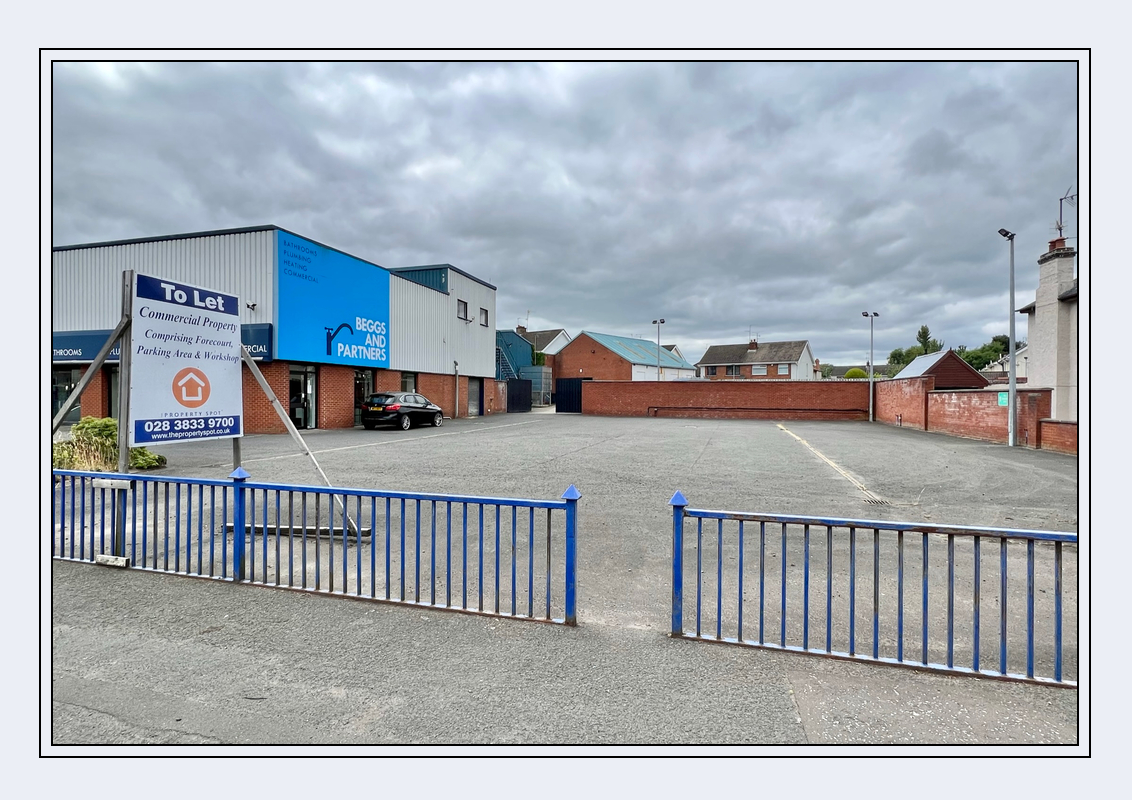
TO LET Commercial Forecourt And Workshop