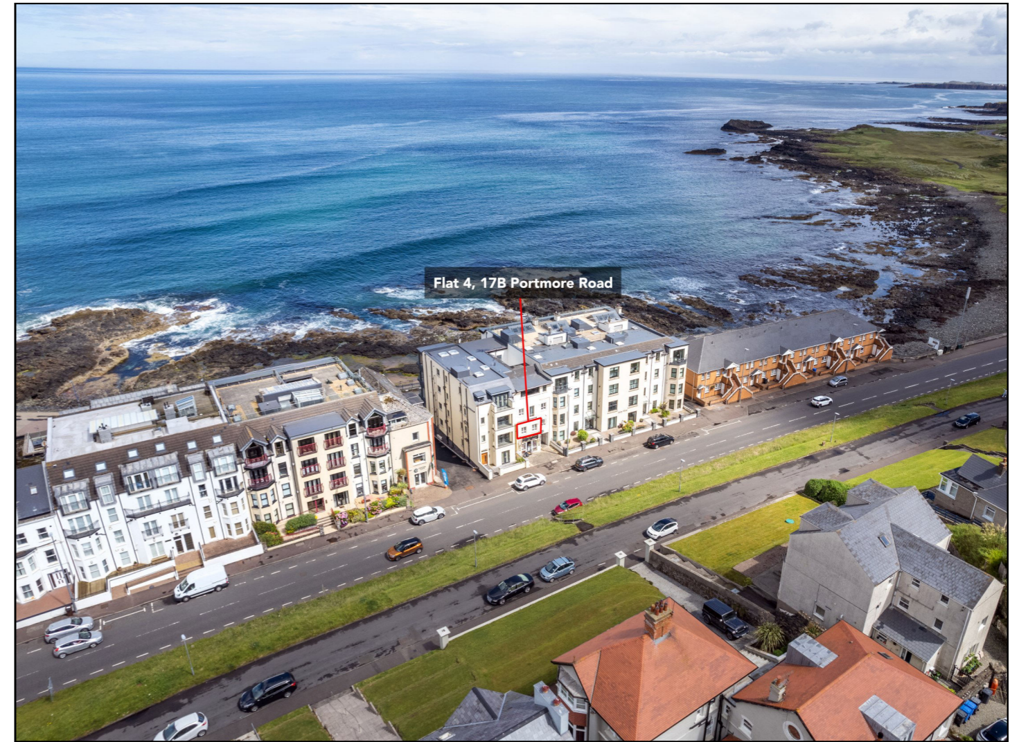
Flat 4, 17B Portmore Road