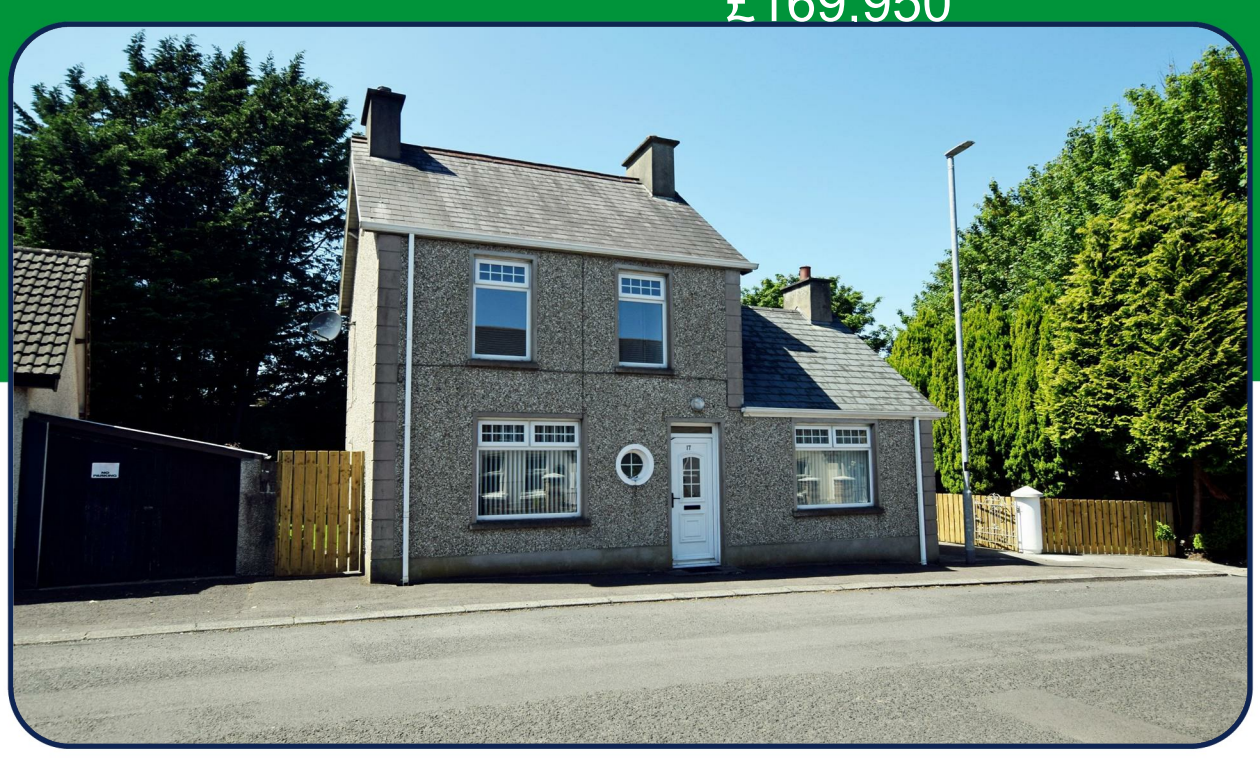
17 Milltown Avenue, Ballymoney, BT53 6RF