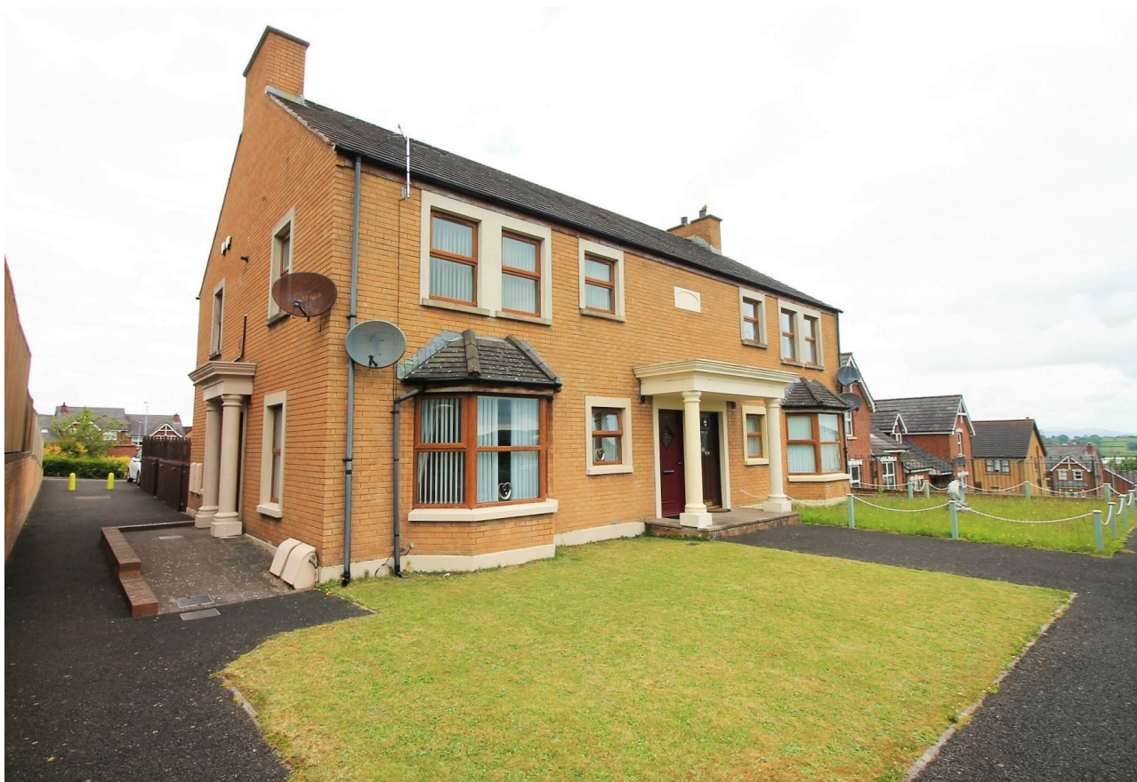
16 Aylesbury Avenue, Newtownabbey, BT36 7XY