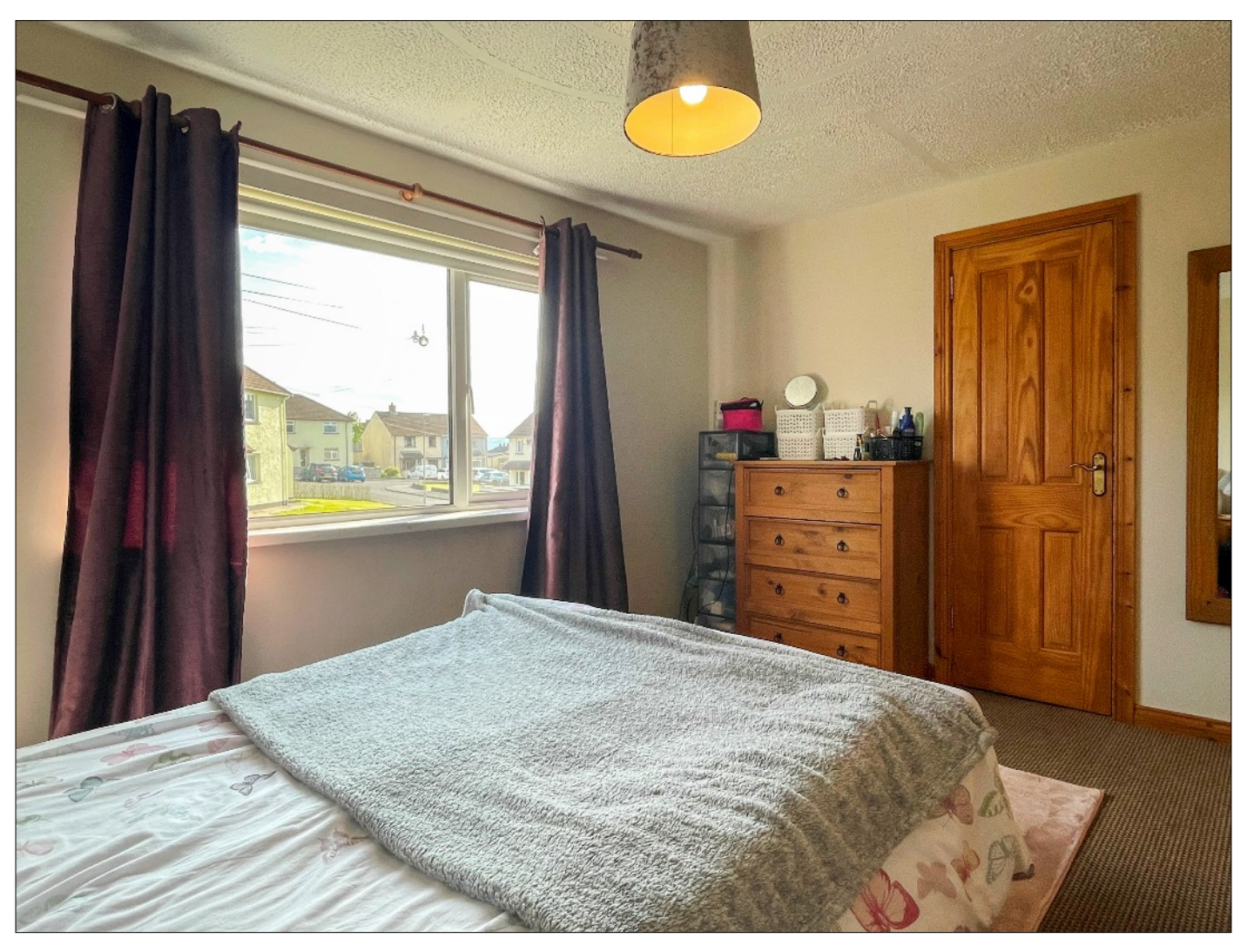
Bedroom (1): 4.08 m x 2.87 m (13' 5" x 9' 5") with walk-in wardrobe with railings and shelving, cloaks cupboard.