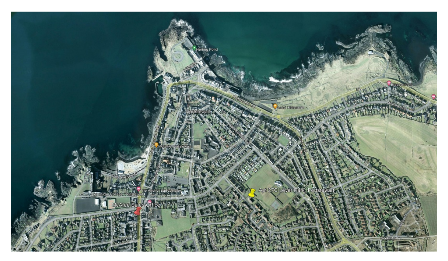
Apt 27C Lever Park, Portstewart, BT55 7ES

Property Location: On approaching Portstewart along the Coleraine Road, turn right at the Diamond roundabout onto Church Street, then first right onto Lever Road, then take the third right onto Lever Park and Number 27C is situated on the left hand side.