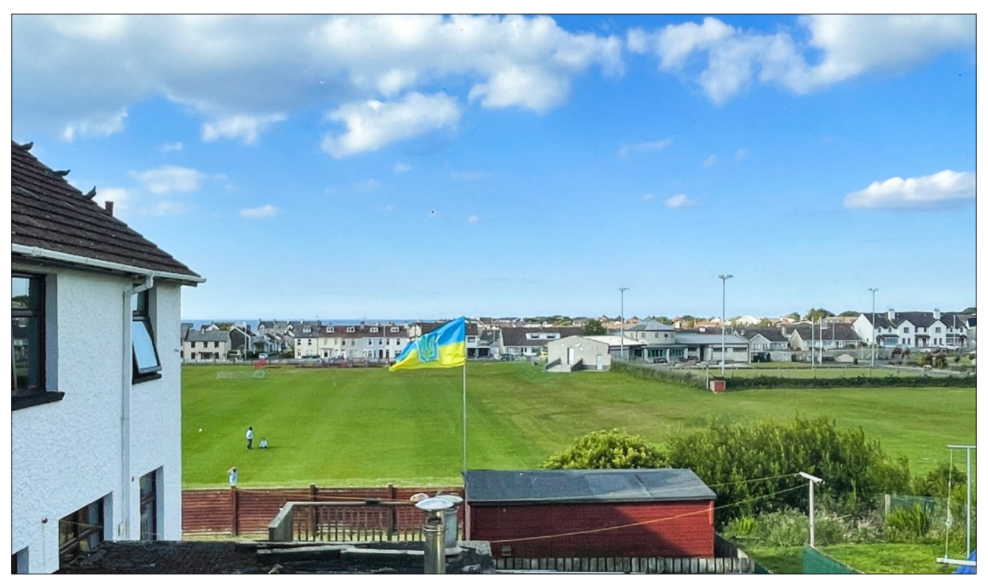
Apt 27C Lever Park, Portstewart, BT55 7ES