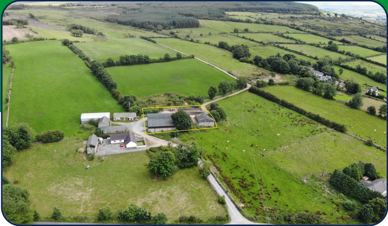
Yard at Oughtagh Road, Londonderry, BT47 3HD