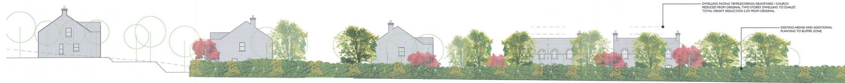
SECTION A-A SCALE 1:200