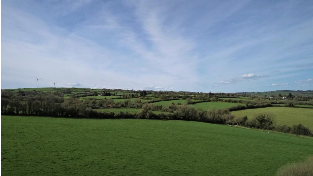
Top field (1 st field) on approach to lands