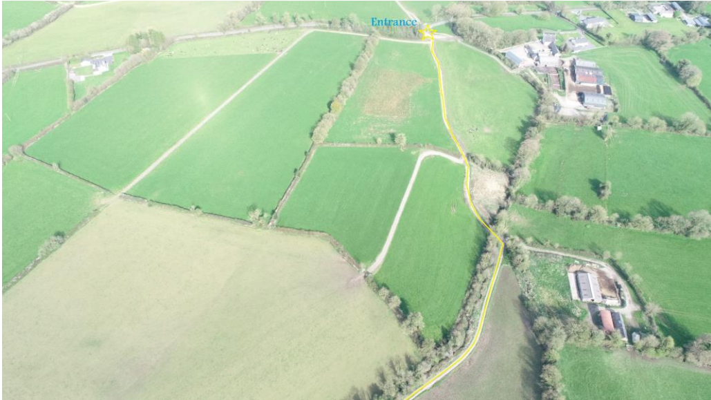
Public Laneway Access in “yellow” from the road

This prime holding will be offered for sale in its entirety, c.63 acres, all in one block, currently in pasture, with public laneway access of 525 metres from the road.