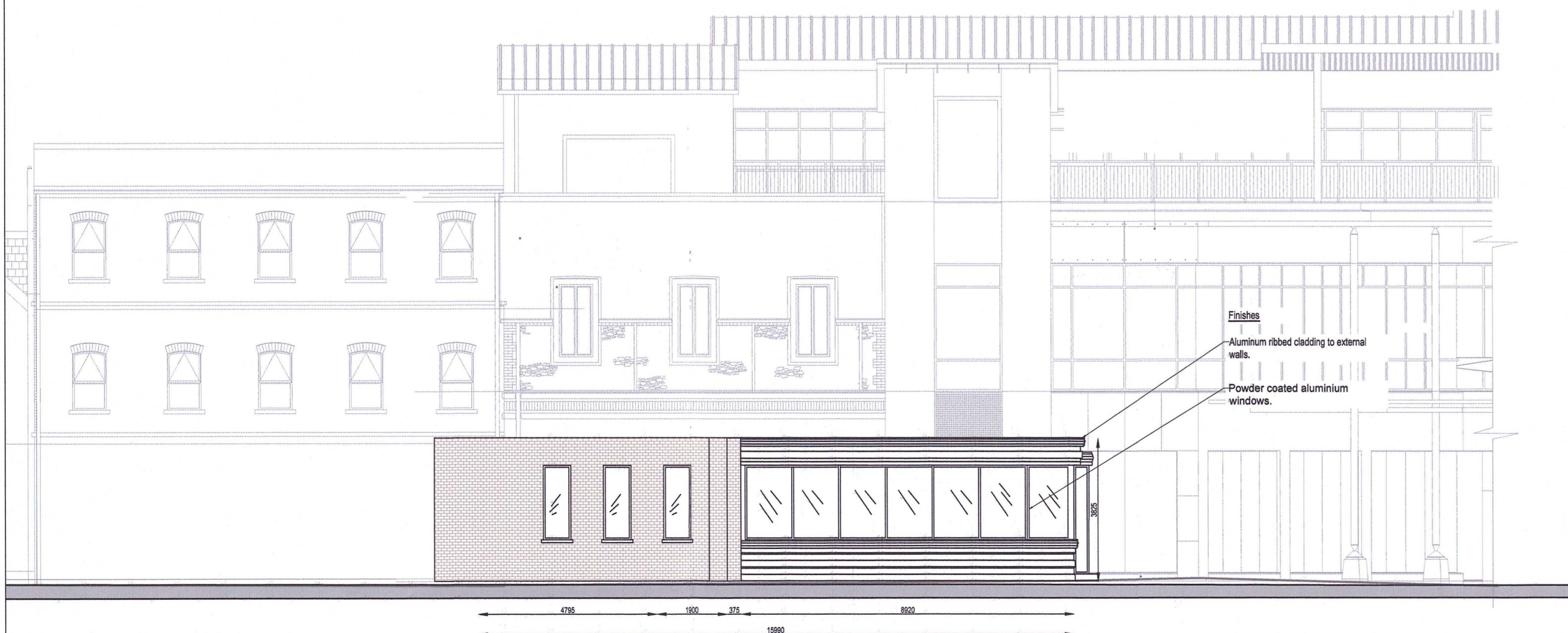
Proposed East Elevation Scale 1:100