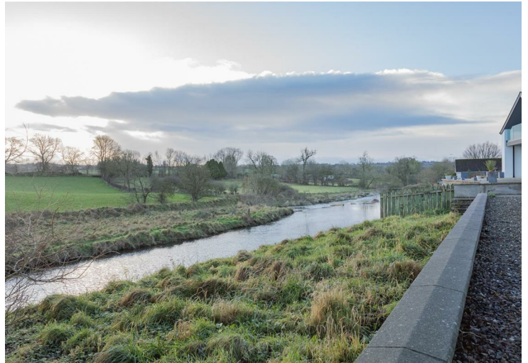
Photography and Floor plans by housefind.co.uk @housefindpropertymarketing Plan produced using Planit.