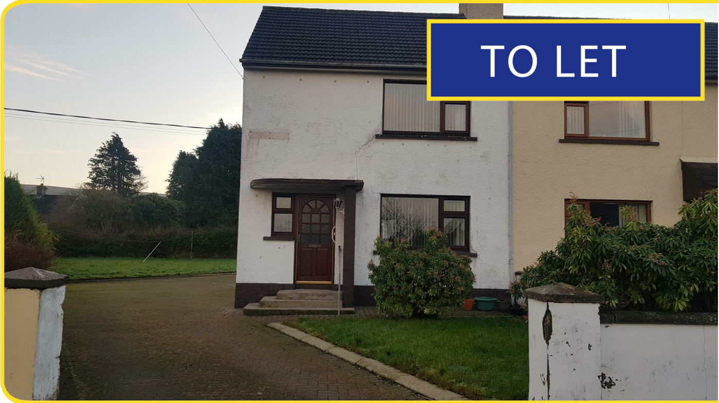
49 Mitchell Park, Dungiven, BT47 4LW