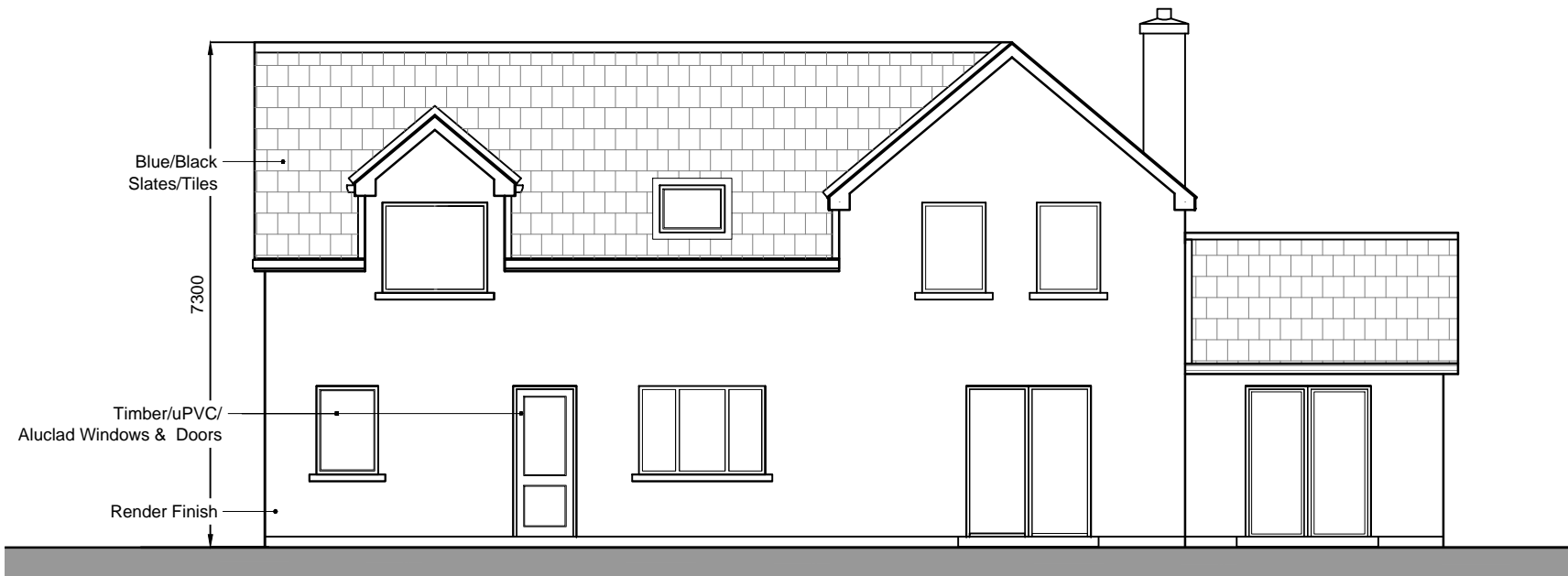
○ REAR ELEVATION scale 1:100