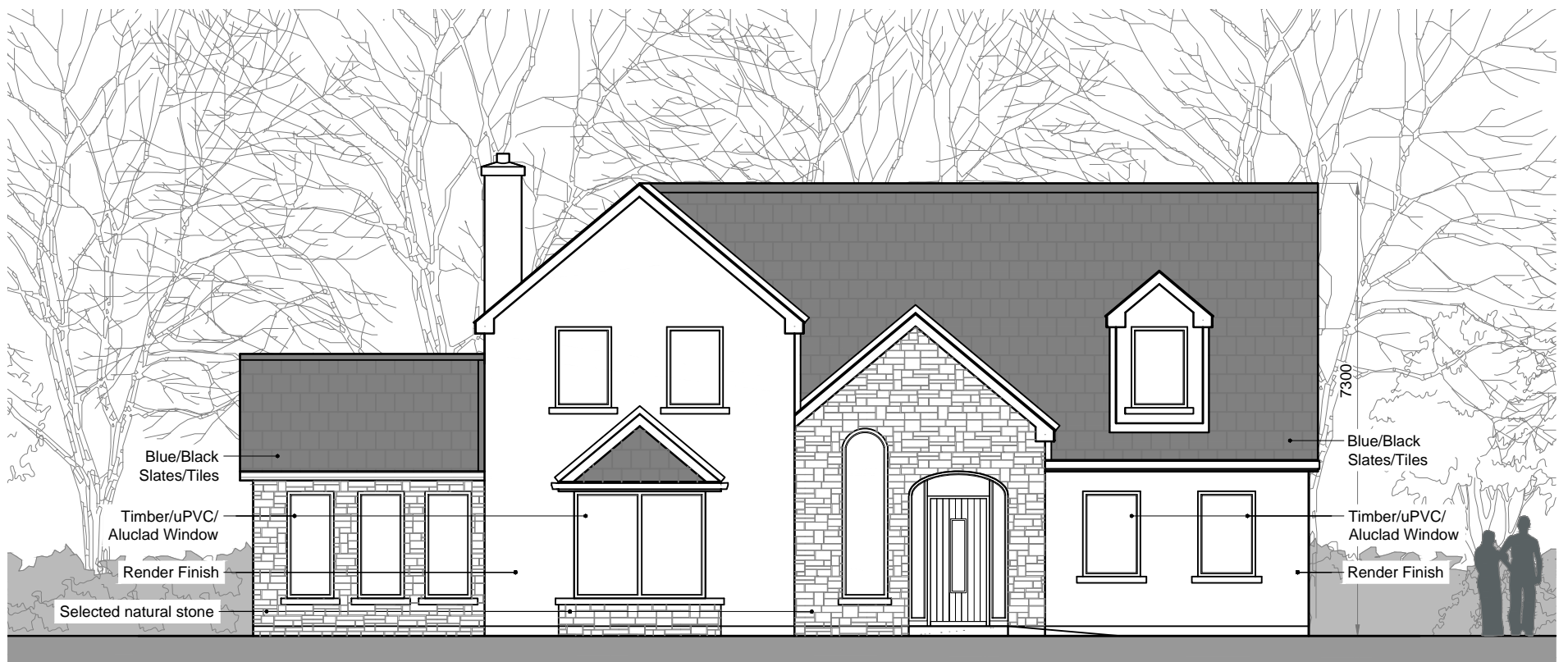
○ FRONT ELEVATION scale 1:100