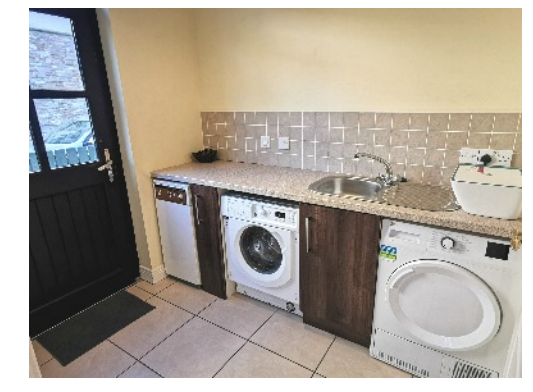
7'8 x 6'1 Range of low level fitted kitchen units with stainless steel single drainer sink with mixer taps, plumbed for washing machine. Tiled splash back, tiled floor, Hardwood back door with 3 point locking system.

Ground Floor WC: 6'4 X 2'11 Low flush wc and wash hand basin. Tiled floor.