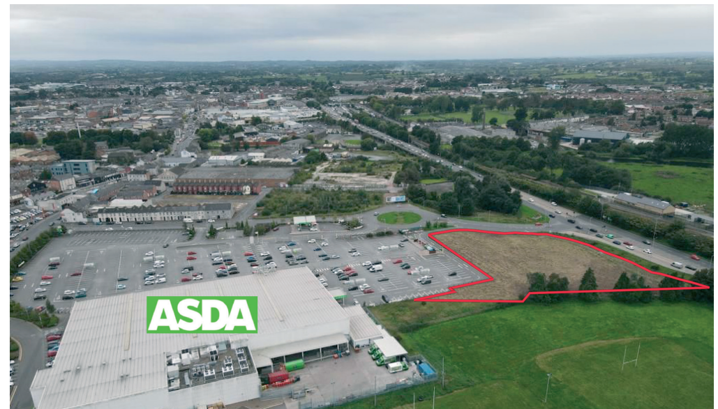
*Photographs outlined for indicative purposes only