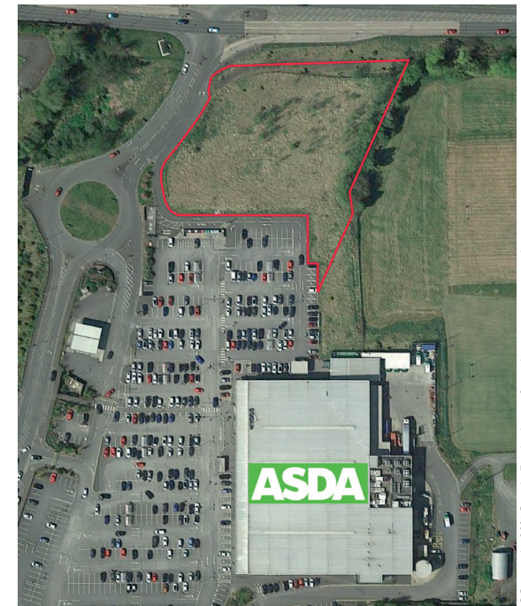
*Outlined for indicative purposes only

Further information is available at www.lisney.com