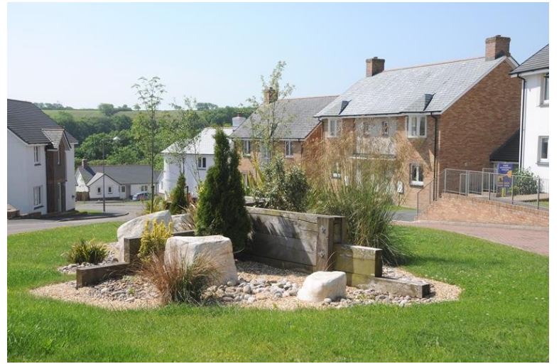
These photographs are for illustration purposes only and are from a similar plot, so should only be used as a guide.