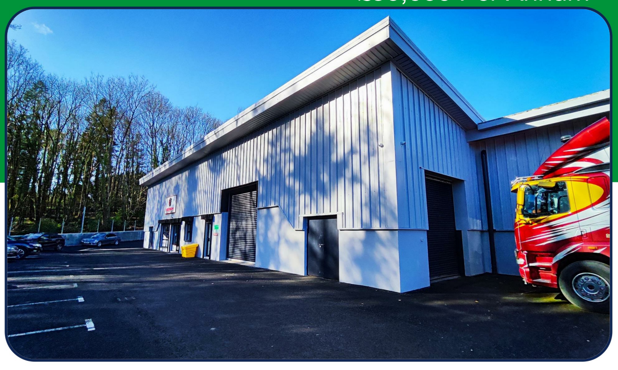
Unit 2, 11 Somerset Road, Coleraine, BT51 3LL