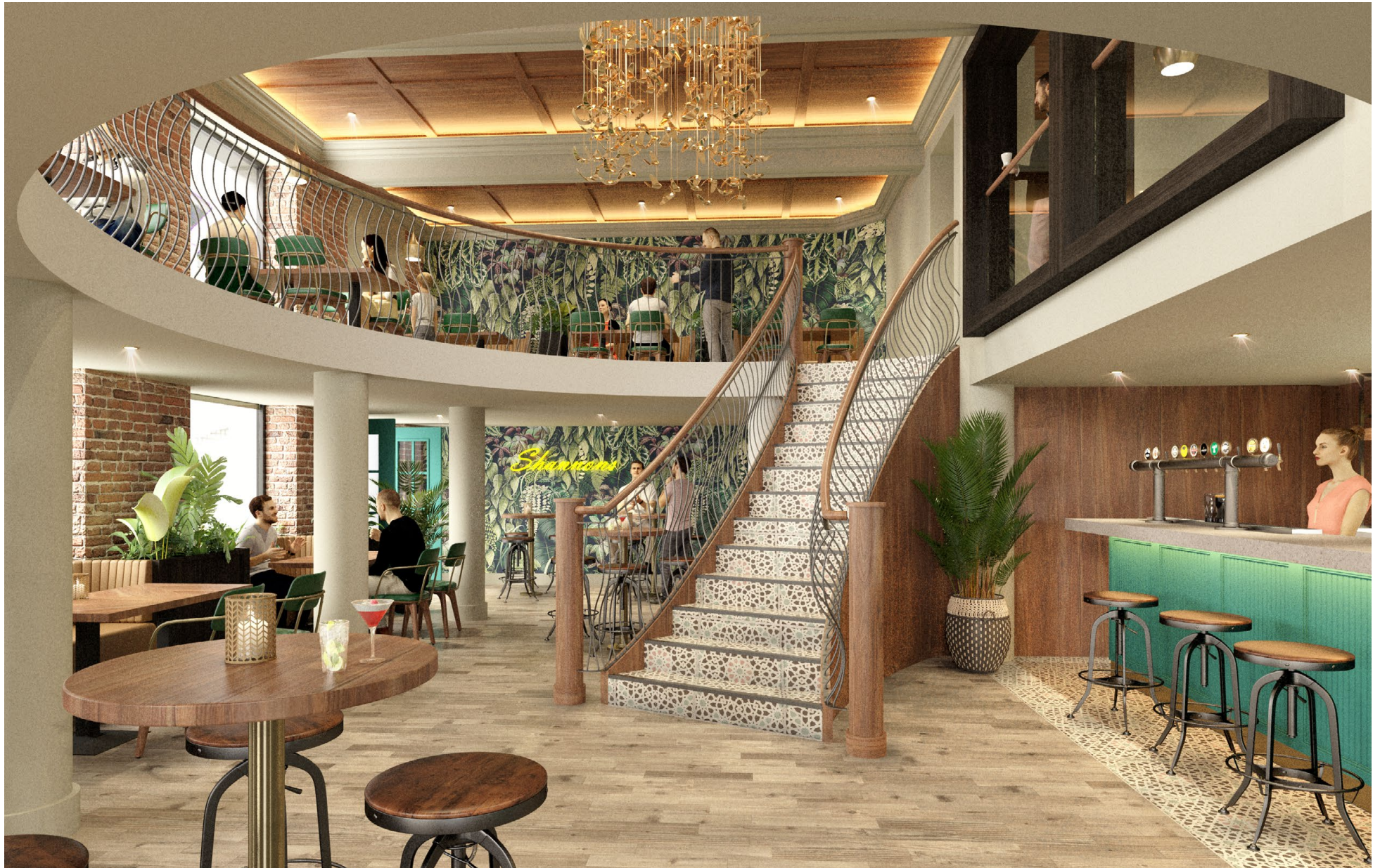
CGI Internal Image

TO LET - 2-4 Market Square, Lisburn, BT28 1XG