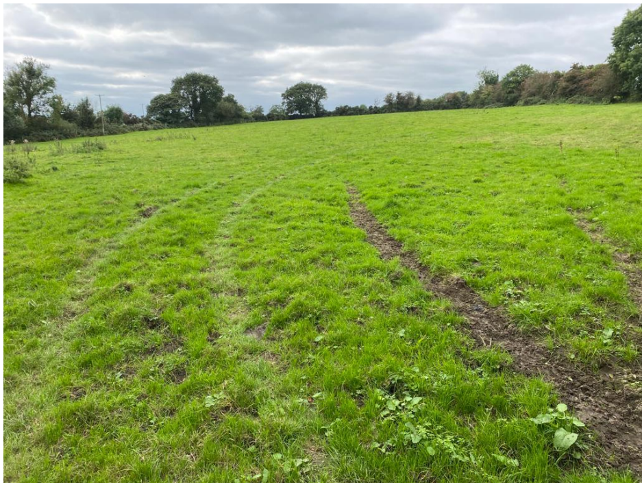
Paddock 1 – Above Farmyard