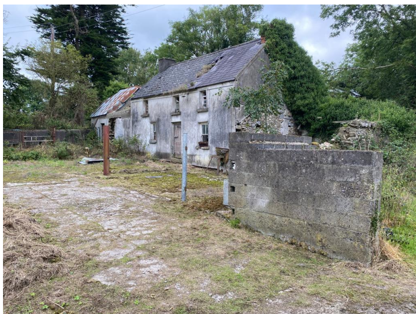
Farmhouse part of Farmyard