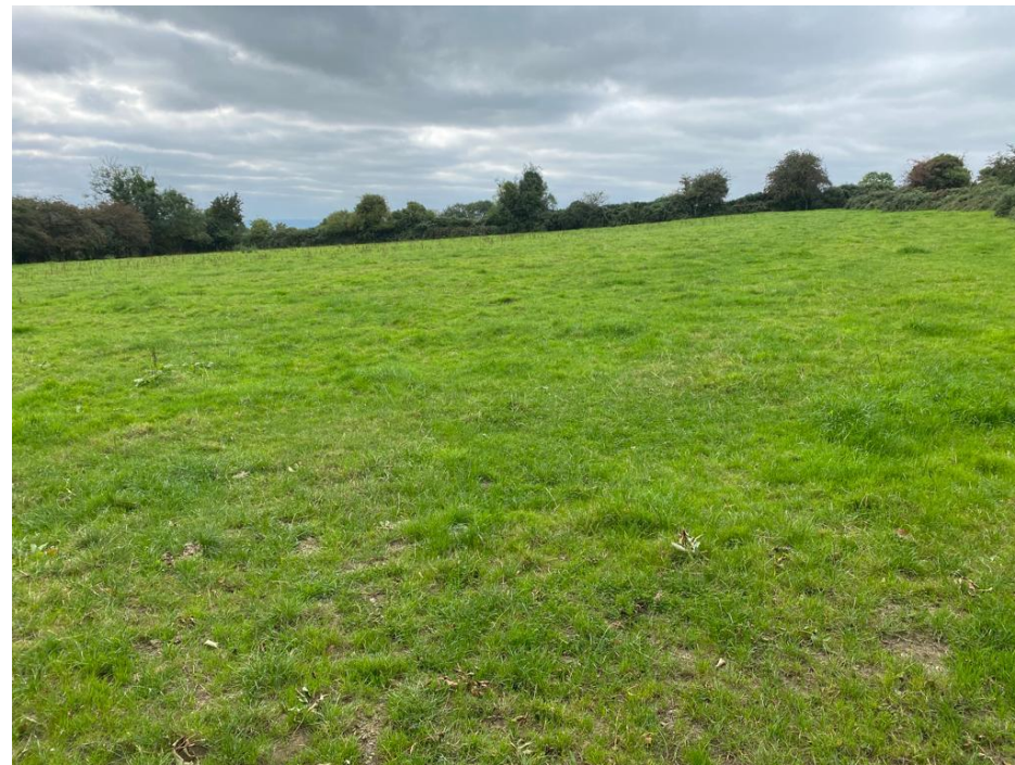
Paddock 2 – Beside Paddock 1