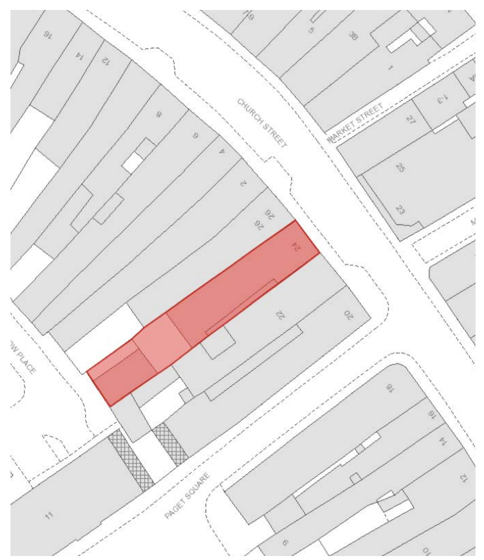
Not To Scale. For indicative purposes only.

1 bed, 1 reception/kitchen-diner, bathroom (electric shower over bath, wc & whb), electric heating. Finishes include plastered & painted/papered walls and ceilings, laminate floors.