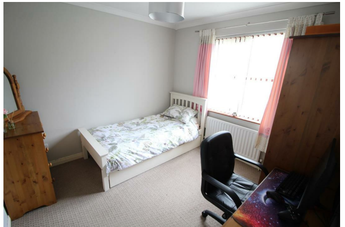
BEDROOM 5 9'9" x 7'10"

Presently used as home office. Fitted with a bespoke range of modern shelving with storage cupboards, fixed drawers and U shaped fixed desk.