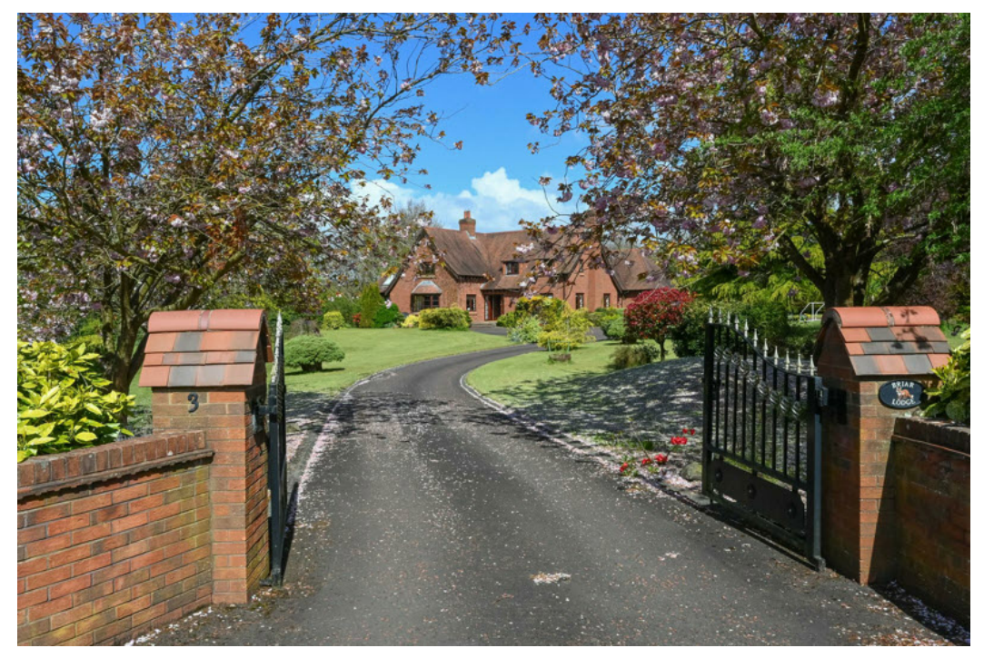
The future road protection corridor bisects the rear of the former garage (now self contained annex) of 3 Wilmont Park and occupies an area used for parking and turning, see line in red.