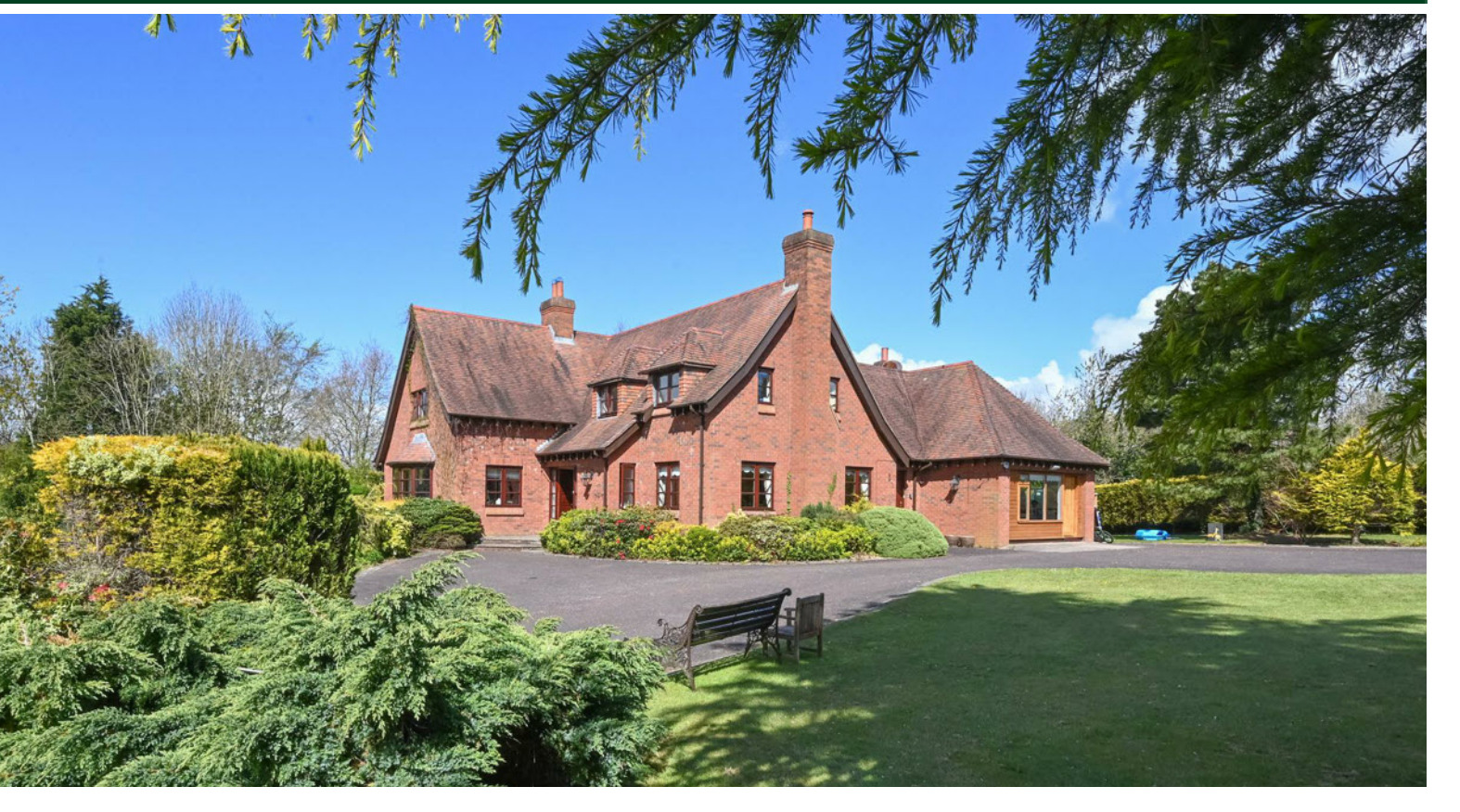
'Briar Lodge', 3 Wilmont Park, Off Upper Malone Road, Belfast, BT17 9JW Offers Over £895,000

Anyone who is interested in the property should be aware that there is a future Road Protection Corridor and proposed Blacks Road Link strategic road scheme running through part of the site.