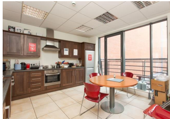
1 st Floor, Rochester Building, 28 Adelaide Street, Belfast