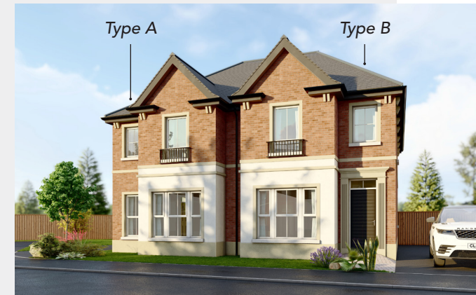
All dimensions are approximate and 3D computer generated images are for illustration purposes only, both of which may be subject to change.