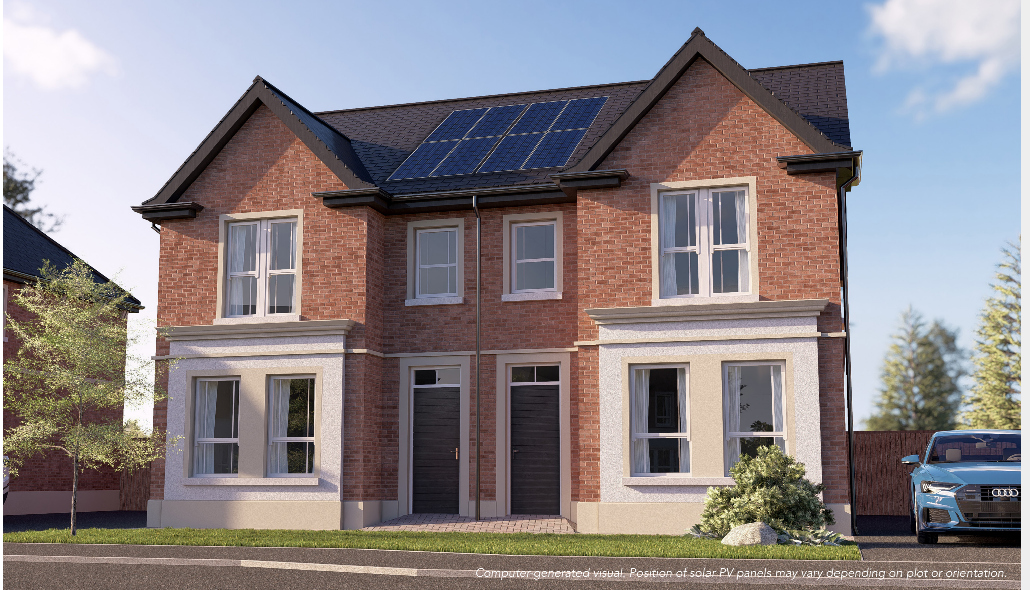
Computer-generated visual. Position of solar PV panels may vary depending on plot or orientation.