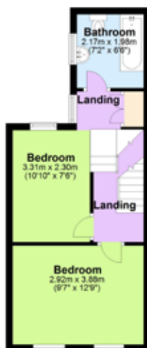
First Floor Approx. 31.4 sq. metres (337.6 sq. feet)