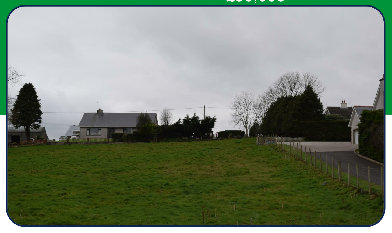
Adjacent to 38 Ringrash Road, Coleraine, BT51 4LJ