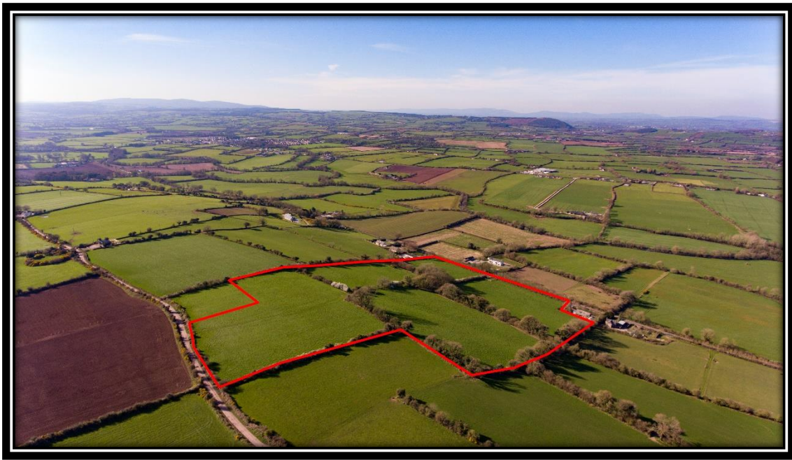
View showing the northern boundary with R628.