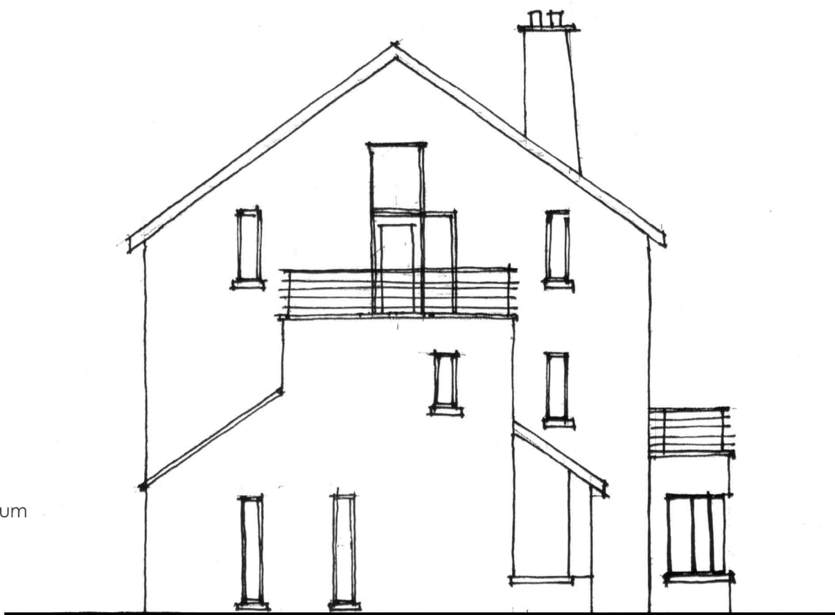
proposed side elevation