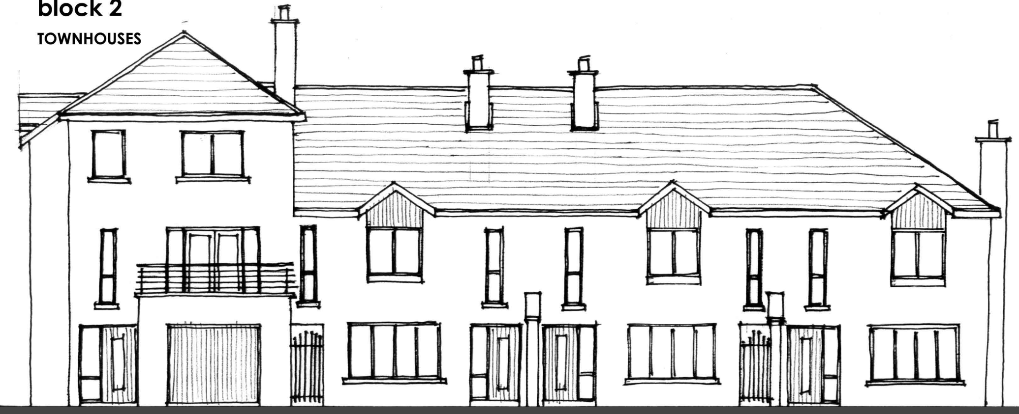
proposed front elevation