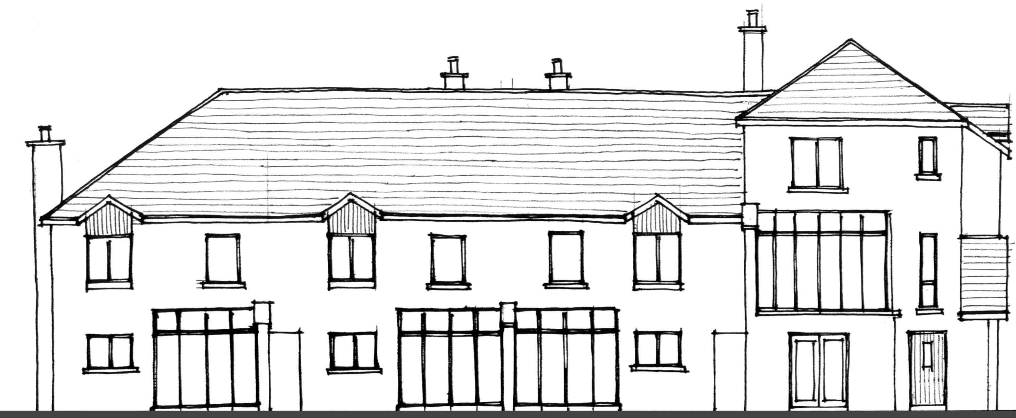
proposed rear elevation