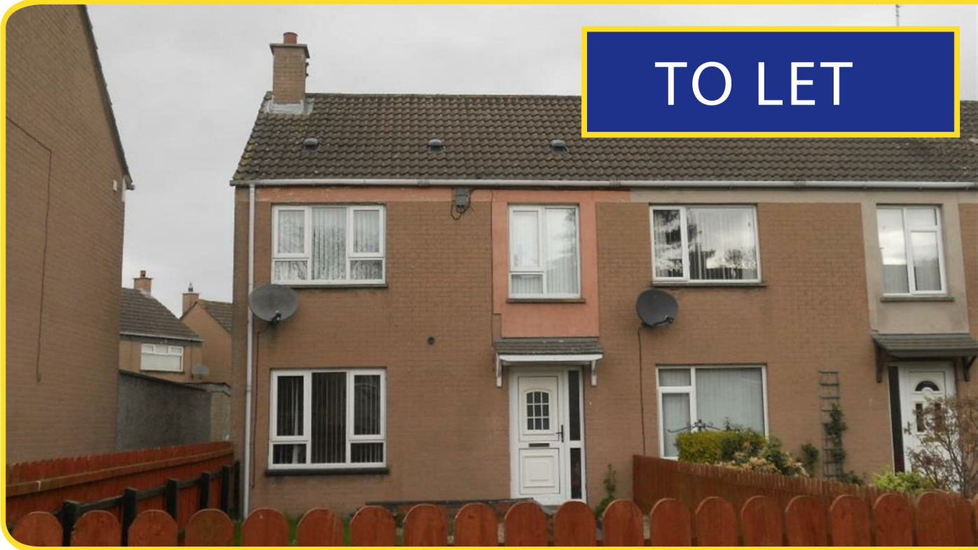
9 Coolestan Walk, Limavady, BT49 9EN