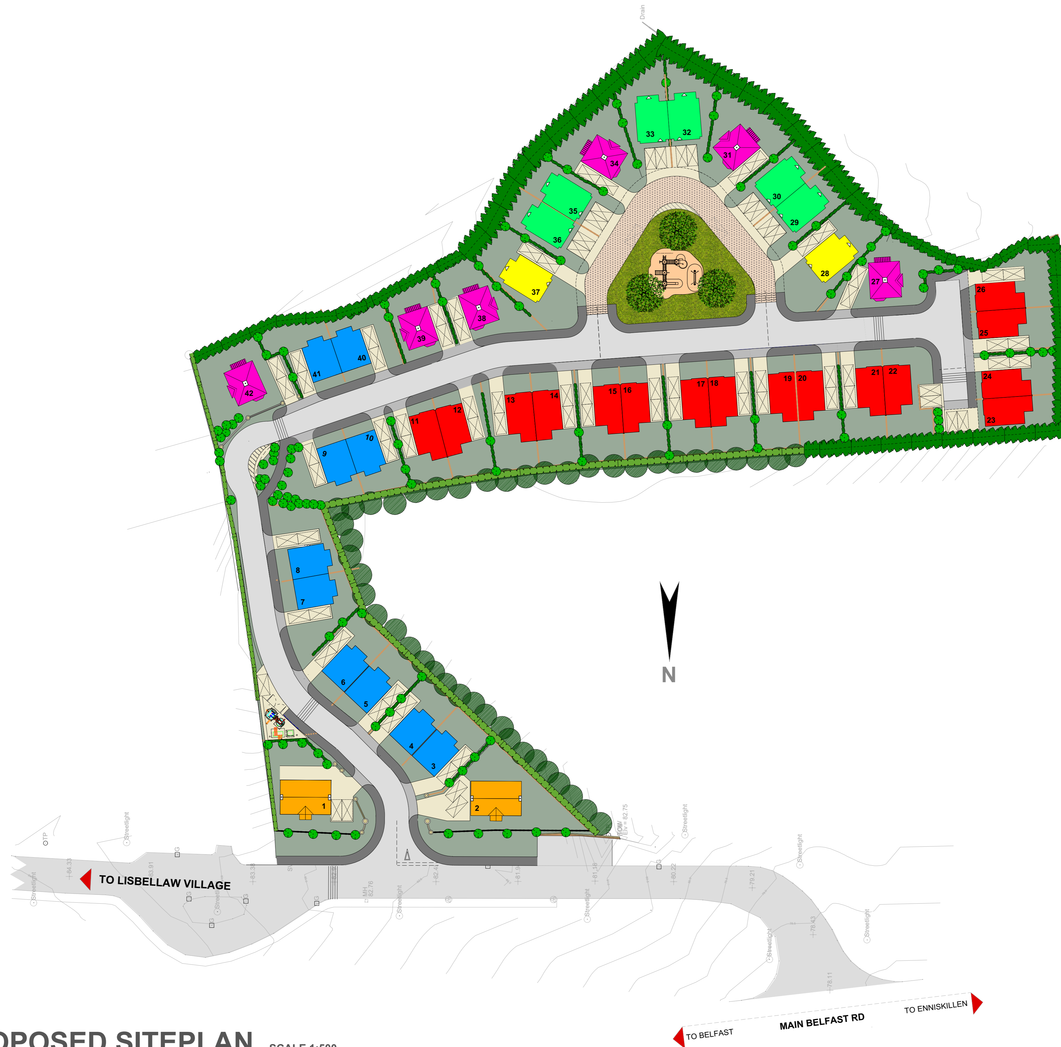
PROPOSED SITEPLAN SCALE 1:500