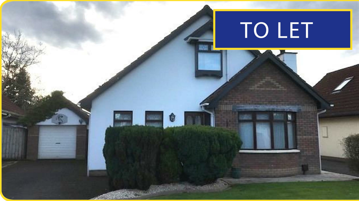
9 Fulton Park, Limavady, BT49 0DY