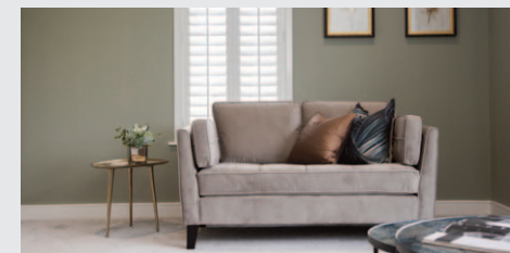
Kitchen and lounge images are actual photographs taken from a previous show home.