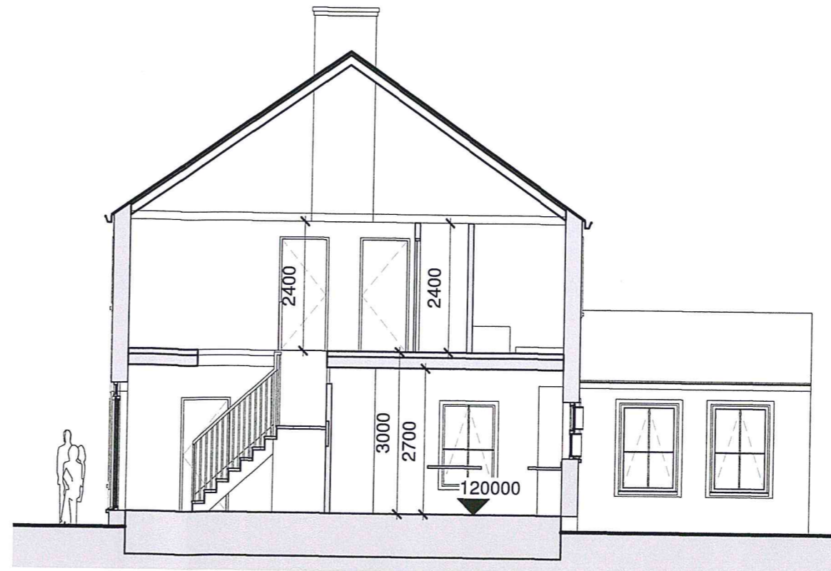
4 type 2 section 1 : 100

Fermanagh and Omagh District Council Planning Act Dec 2011 Type 2 sliding sash style windows with white uPVC frame GRANTED Subject to Conditions (if any) as set out on Decision form No. LA10/16/1246/F LA10 Date... 4/5/18