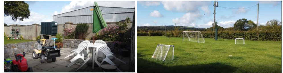
Patio Area to side with garden to rear

OUT-BUILDINGS : Walled in yard with 4 stone buildings / stables and a 6 span hay barn with a 22ft lean-to to one side and a 30ft lean-to to the other side, walled in yard to the other side of the haybarn with cattle crush facilities and collecting pen in the field opposite the farmyard.