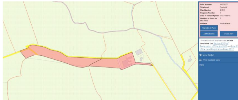
Residence & Out-buildings on c.6 Acres