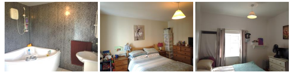
Bedrooms & Bathroom

Bathroom 9' x 8'3 (2.7 x 2.5) Tiled flooring, WH, WC and Corner Bath with Mira Elite shower overhead