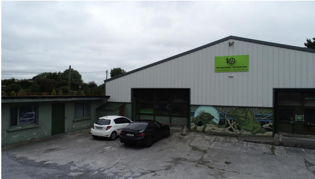
Front of Building with office to the left

Excellent sporting facilities, church, pubs, post office, petrol station, convenience store, butchers, primary school with choice of secondary schools at Thomastown / Kilkenny etc..