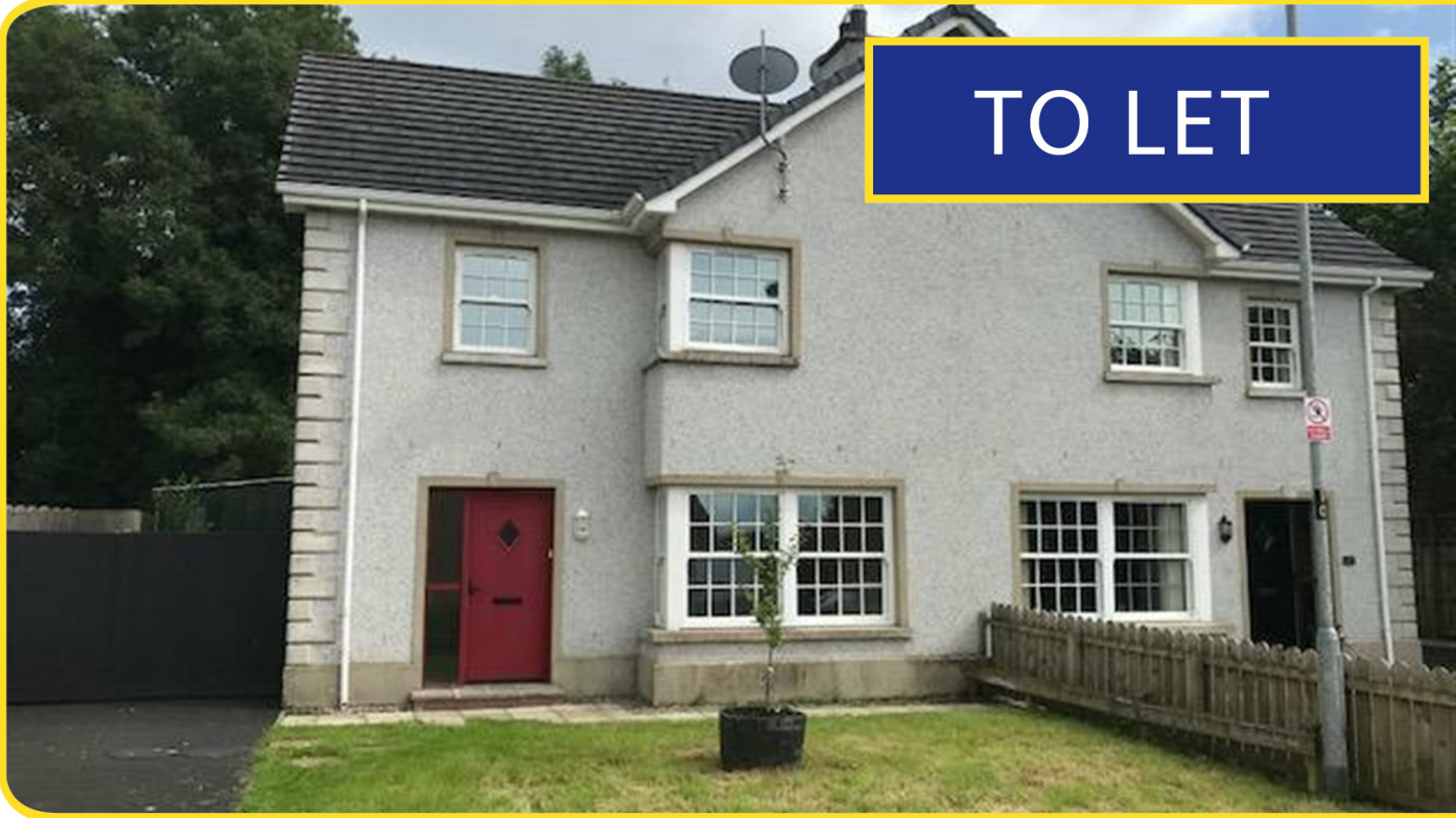
21 The Oaklands, Londonderry, BT47 4FF