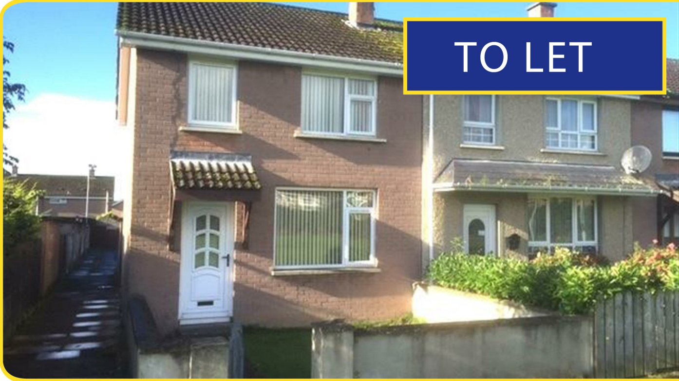
11 Glenbeg Walk, Limavady, BT49 0RL