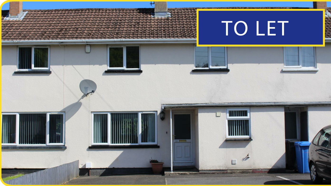
23 Churchill Road, Limavady, BT49 9PW