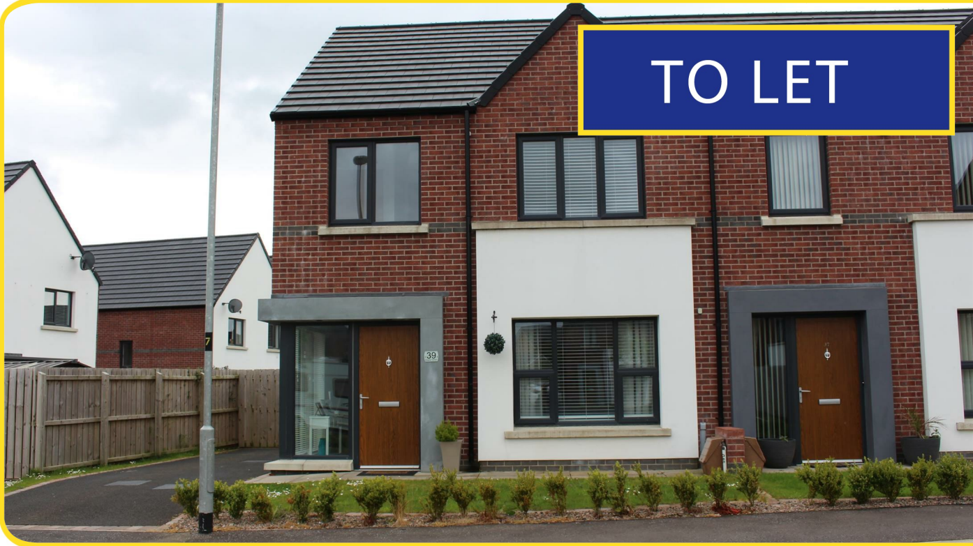
39 Brighter Gardens, Limavady, BT49 0GH