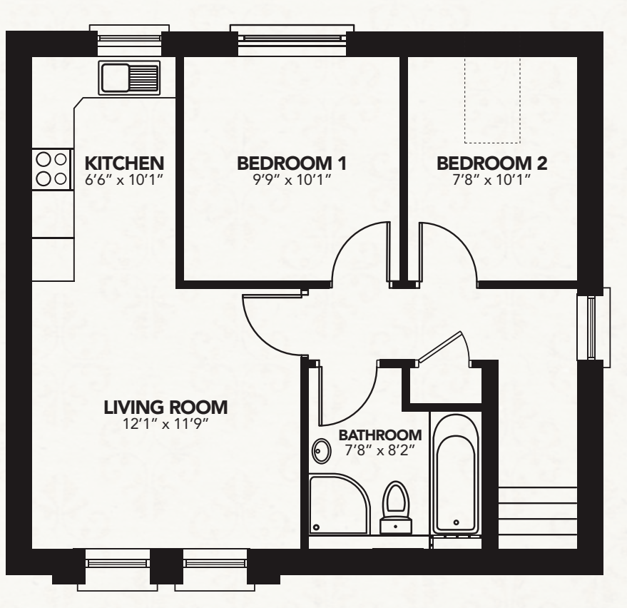
First Floor - APT 2