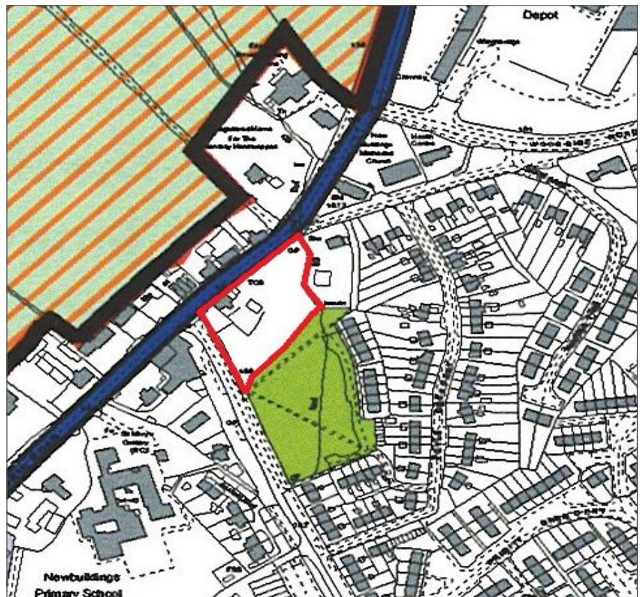
FOR INDICATIVE PURPOSES ONLY