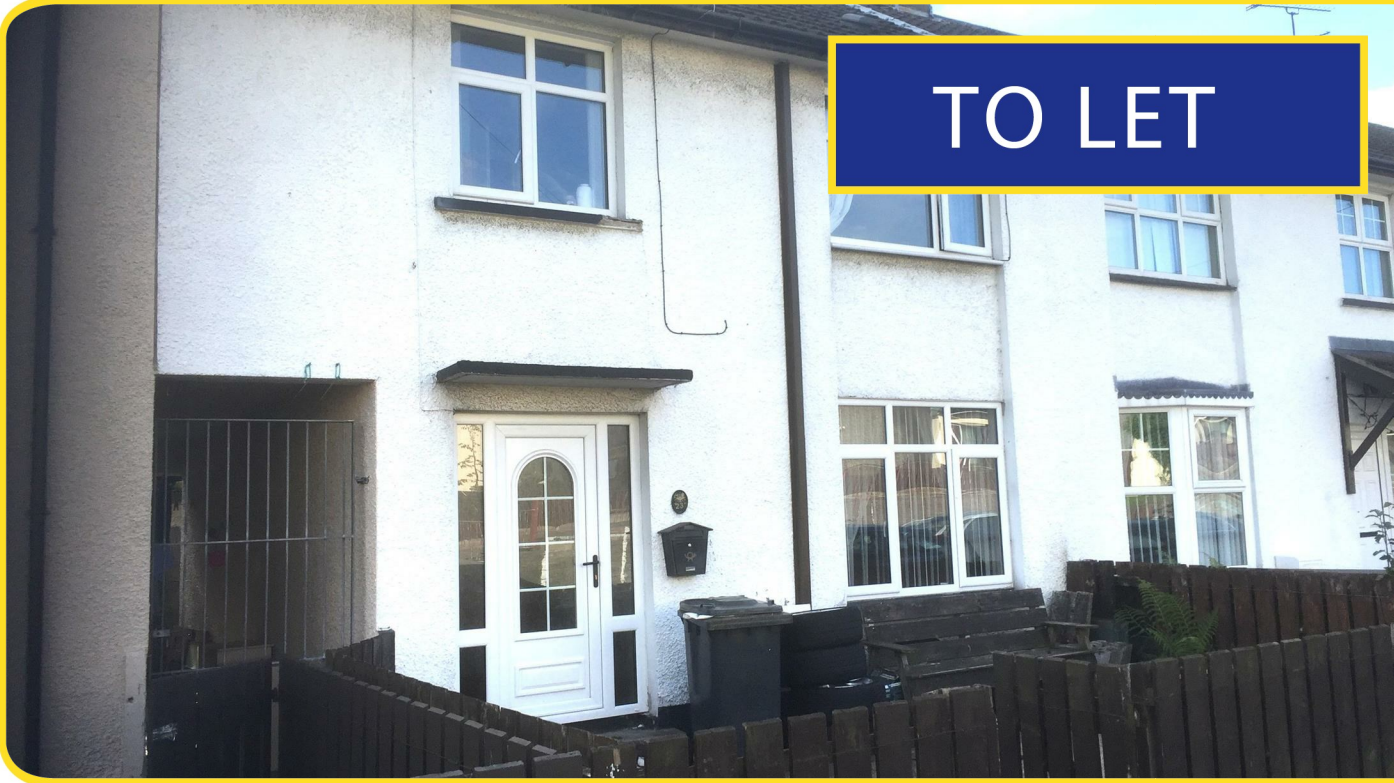
23 Sperrin Road, Limavady, BT49 0AS