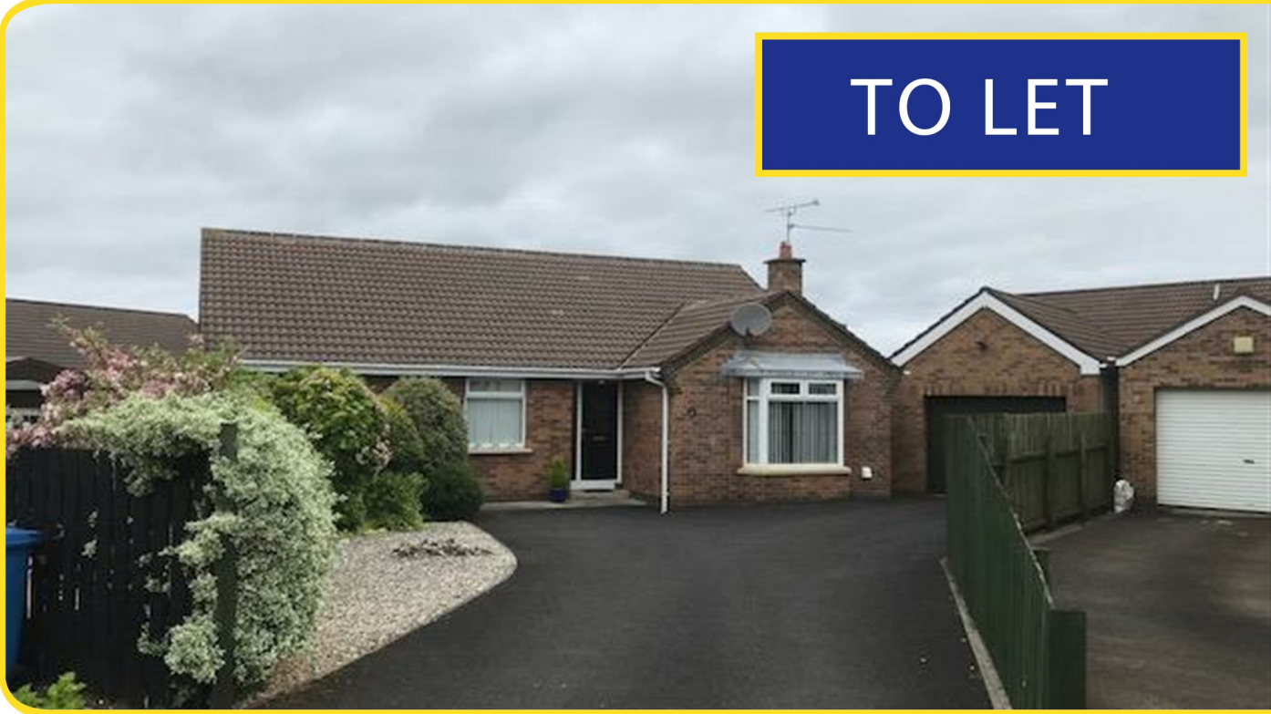
49 Janes Valley, Limavady, BT49 0EH