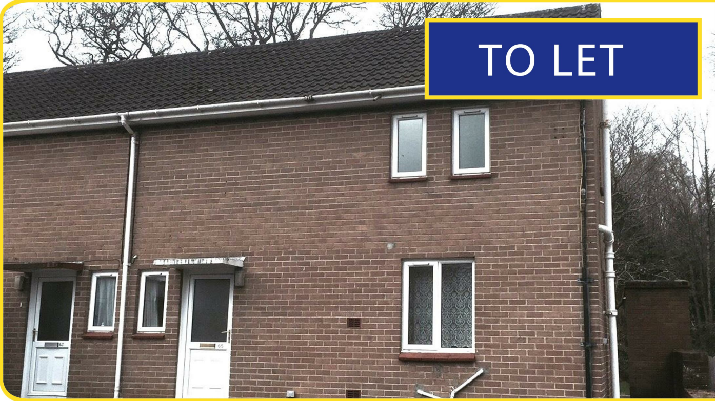
65 Hill Close, Ballykelly, BT49 9QA