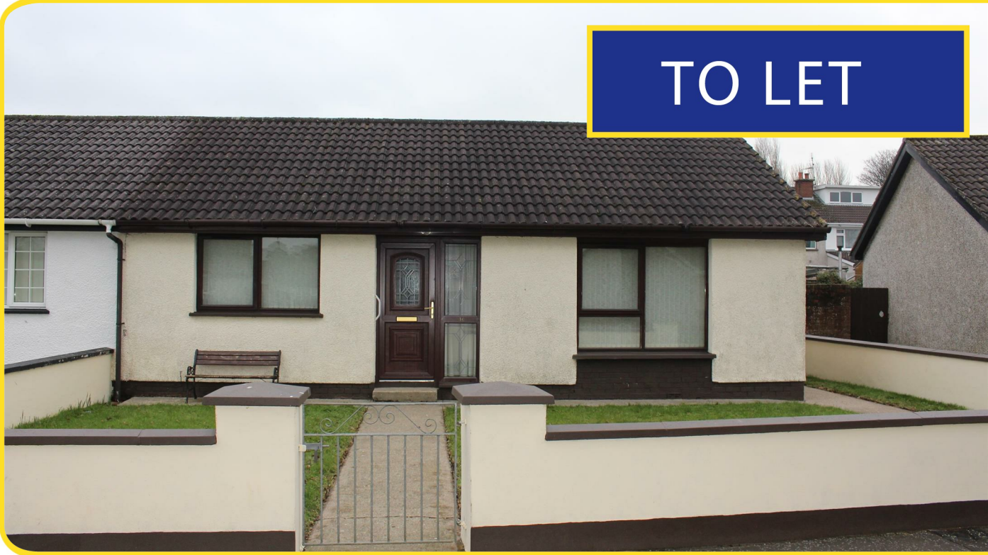
16 Glenburn Way, Limavady, BT49 0RN