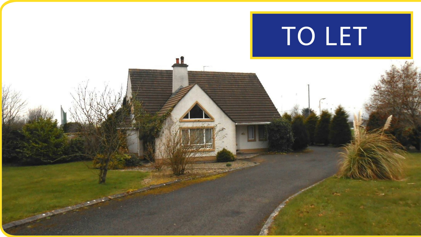
299 Drumsum Road, Limavady, BT49 0PX