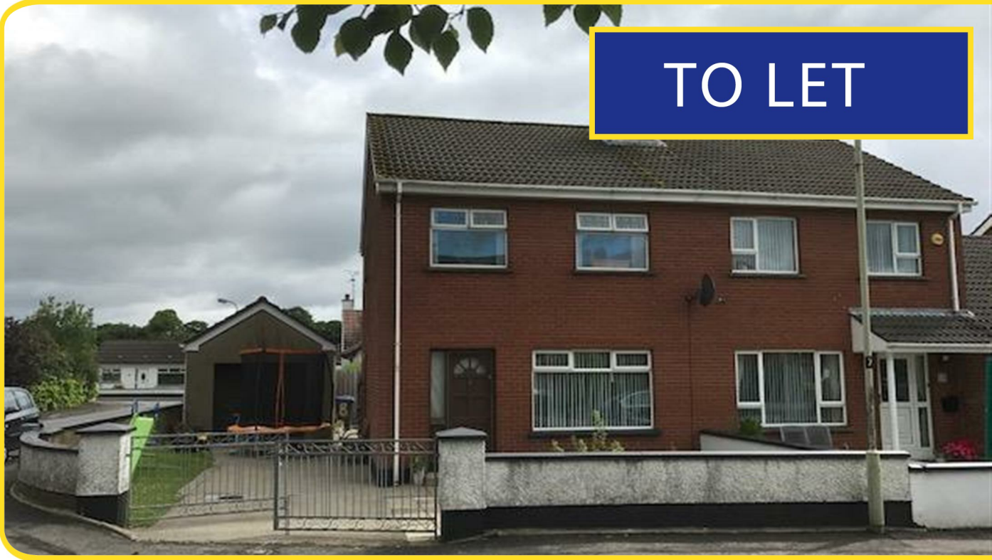
8 Castle Park, Limavady, BT49 0SB